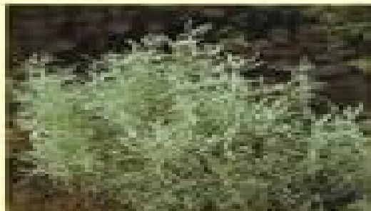
Flowering plant - 'Crown of Thorns'