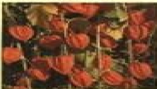
Flowering plant - 'Crown of Thorns'