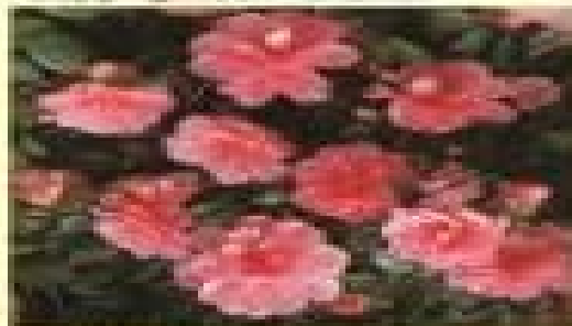
Double rose variety 'Charles de Gaulle'