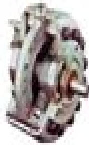
Radial Piston Pump