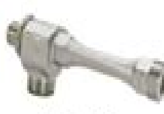
Eductor Jet Pump