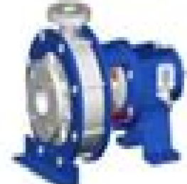
Radial Flow Pump