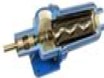
Progressing Cavity Pump