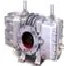
Root Type Pump