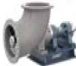
Axial Flow Pump