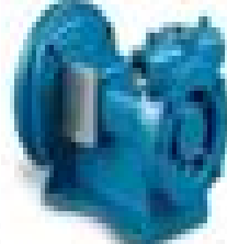
Regenerative Turbine Pump