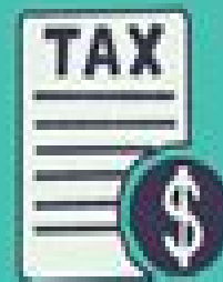
Earned Income Tax Credit