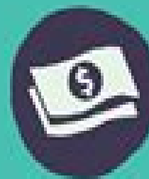
Supplemental Security Income