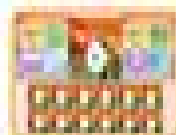
Year 4 Maths Meeting: Number Place Value

Year 4 Maths Meetings are designed to be a fun and interactive way for students to learn and practice their skills. They are a great way to reinforce what they have learned in class and to develop their problem-solving and communication skills.