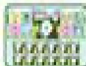
Year 4 Maths Meeting: Addition and Subtraction