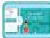
Year 4 Maths Meeting: Fractions

These are the suggested topics for the Year 4 Maths Meetings. They are designed to be fun and interactive, and to help students to learn and practice their skills.