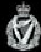
Royal Irish Regiment