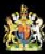
General Service Corps