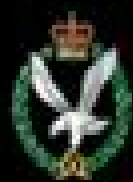
Army Air Corps