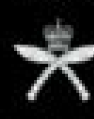
Royal Gurkha Rifles