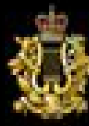
Corps of Army Music