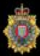
Royal Logistic Corps