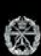
Small Arms School Corps