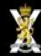
Royal Regiment of Scotland