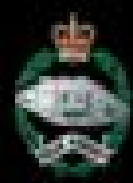
Royal Tank Regiment