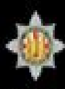
Royal Dragoon Guards