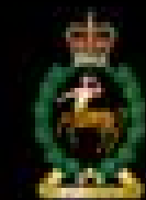
Royal Army Veterinary Corps