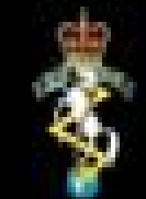
Royal Electrical & Mechanical Engineers