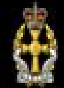
Queen Alexandra's Royal Army Nursing Corps