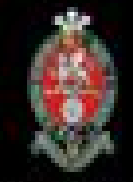
Princess of Wales's Royal Regiment