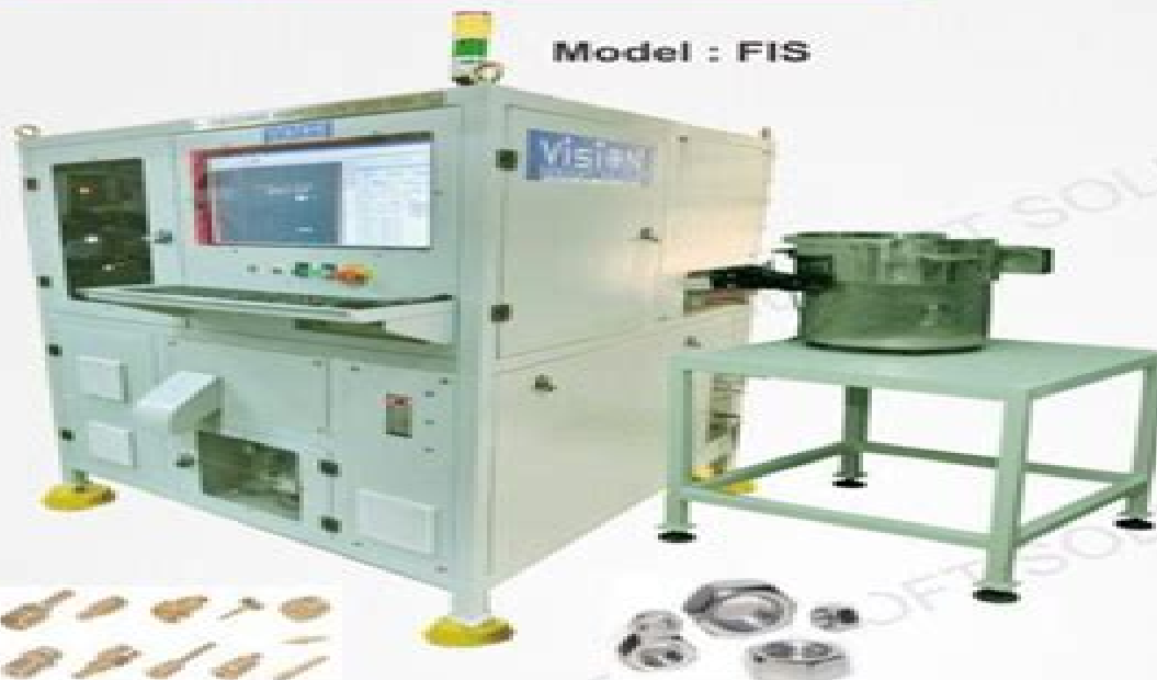
Model : FIS