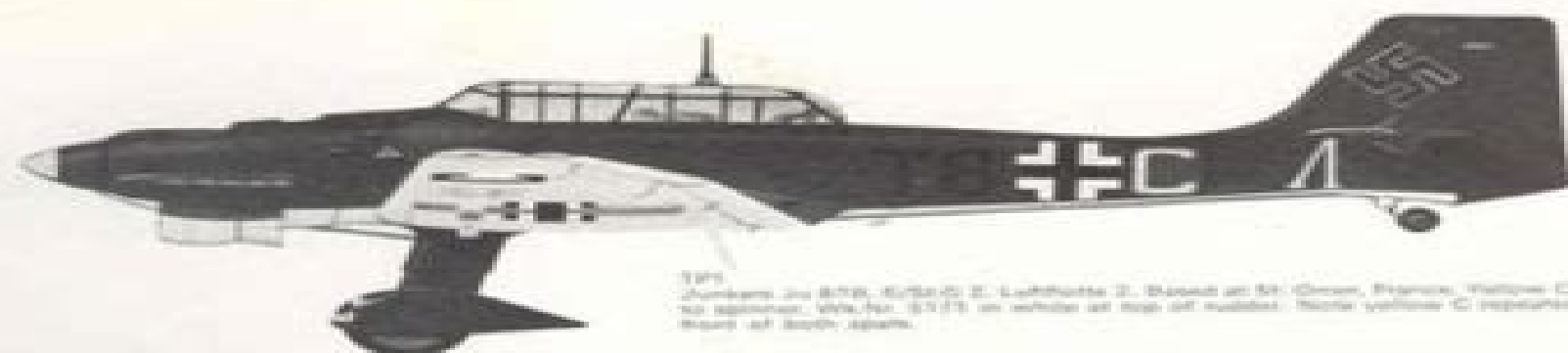
TP1 Junkers Ju 87B, 4/52-5 Z, Luftwaffe 2, based at St Omer, France. Yellow 'C' and 'A' to appear. White '1' on white at top of rudder. Note yellow 'C' repeated on the front of both wings.