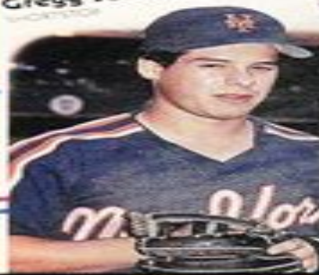
Gregg Jefferies MONSTER

A HANDBOOK OF INSIDER SECRETS AND STRATEGIES