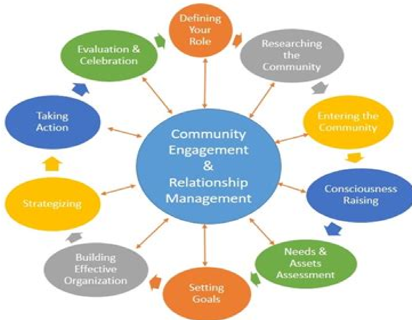
Figure created by Author based on Brown & Hannis, 2012, p.84