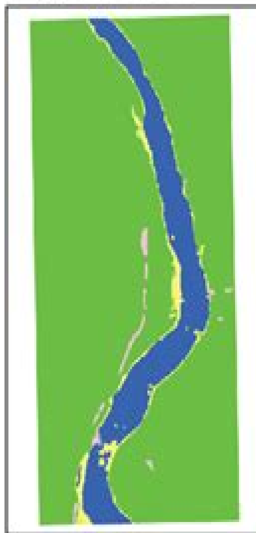
(b) Med n SRC

False Positive (type 1 error) True Positive