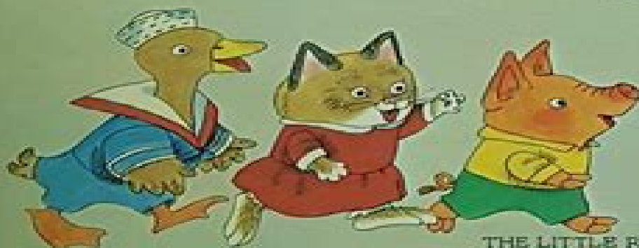
THE LITTLE RED HEN