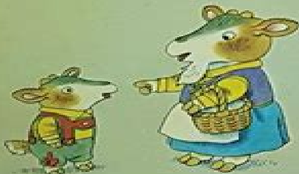
THE WOLF AND THE KIDS