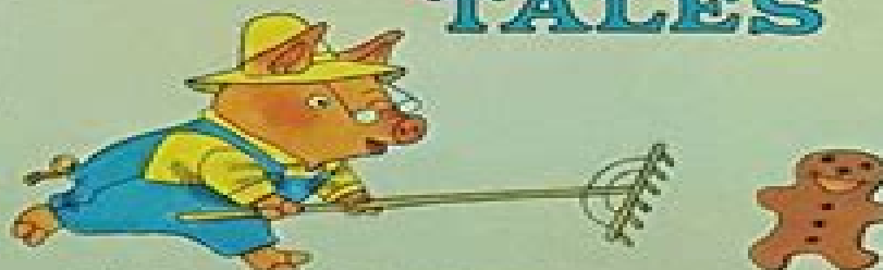
THE GINGERBREAD MAN