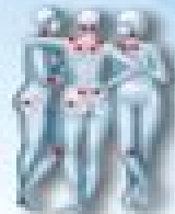
Twisted joints in rheumatoid arthritis

Rheumatic diseases are a group of diseases that affect the joints and the connective tissue. They are characterized by inflammation and the formation of new blood vessels. The disease is most common in the joints, but it can affect any part of the body. The disease is more common in women than in men, and it is more common in people who are over 40 years old.