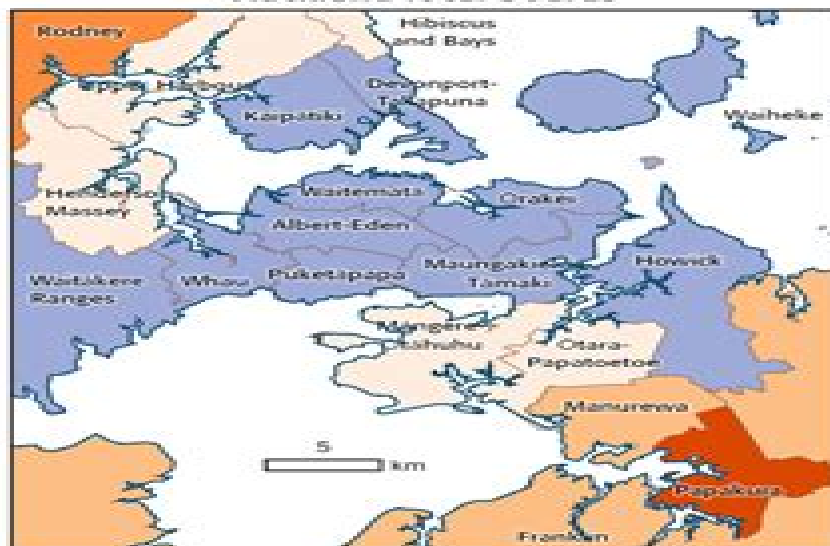
Auckland local boards