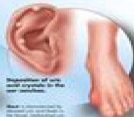
Degeneration of the joint capsule in the ear.

Joint inflammation accompanying psoriasis is a condition in which the joints become inflamed. It is characterized by the formation of inflamed nodules (psoriatic nodules) in the joints. The disease is caused by an autoimmune reaction in which the body's immune system attacks its own tissues. The disease is characterized by joint pain, swelling, and stiffness, particularly in the morning. It can also affect other parts of the body, such as the skin, lungs, and heart.