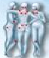
Twisted joints in rheumatoid arthritis

Self-healing rheumatic diseases are a group of diseases that are characterized by self-healing. They are caused by an autoimmune reaction in which the body's immune system attacks its own tissues. The disease is characterized by joint pain, swelling, and stiffness, particularly in the morning. It can also affect other parts of the body, such as the skin, lungs, and heart.