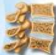
Spine with ankylosing spondylitis. The degree of loss of mobility from the top to bottom is illustrated.

Rheumatic diseases with chronic inflammation are a group of diseases that are characterized by chronic inflammation. They are caused by an autoimmune reaction in which the body's immune system attacks its own tissues. The disease is characterized by joint pain, swelling, and stiffness, particularly in the morning. It can also affect other parts of the body, such as the skin, lungs, and heart.