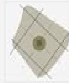
c. Urban layouts also grew as transportation developed with the production of cars and roads, cities were no restricted in city boundaries.