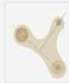
d. Many regions where a city were developed using infrastructure from each other and creating larger neighbourhoods within the space.