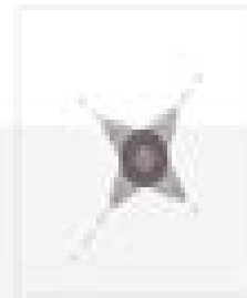
b. As engineering developed, cities were able to expand - at first using the bones of city street grids or rivers.