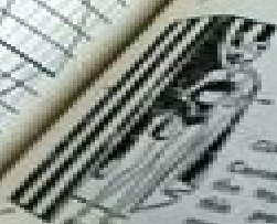
1. Journal of the American Medical Association , 1997; 277: 1039-1043.

Conveniently carried in the trunk of your car, the portable dressing room is set up in the back in a few minutes.