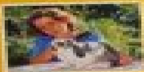
Poppet comes to her government day friends