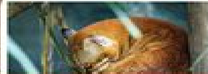
Asian Golden Cat