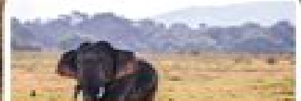
Sri Lankan Elephant