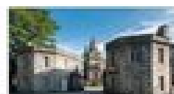
April The Museum's Collection