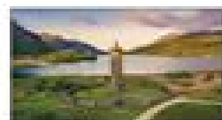
Responsible Classification Management