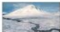
December (November 1999 - May 2000)