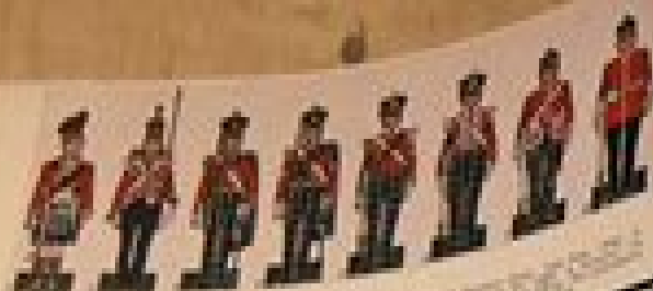
SEVEN REGIMENTS, 1660-1670. The first six are the original regiments, the seventh is the 1st Black Watch, 1684-1707.