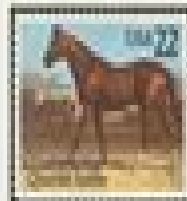
Quarter Horse — A1538

2184 A1537 22c gray green & pink red a Post marking (PM)