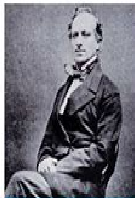
Francis Rynd Injection