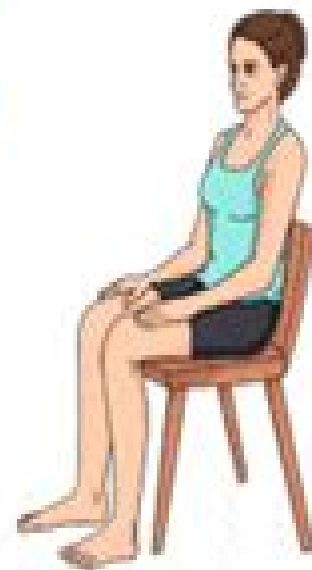
Progressive Muscle Relaxation