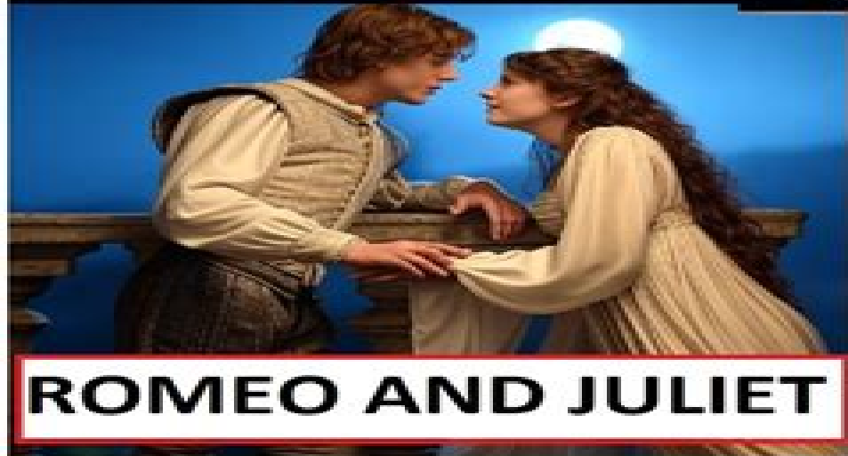
ROMEO AND JULIET