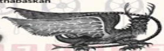
PIASSA Mississippian (?) / Unknown

Many Tribes; Great Lakes and Atlantic Region