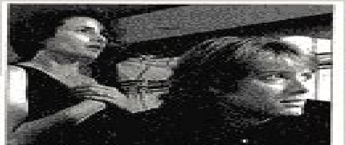
Annette Bening and James Spader in "Sex, Lies and Videotape"

Steven Soderbergh leaves some lessons in Hollywood. The film "Sex, Lies and Videotape" is a masterpiece of the new wave of independent cinema. It is a film that was both sexy and truthful, a film that was both a lie and a truth. It was a film that was both a success and a failure. It was a film that was both a masterpiece and a disaster.