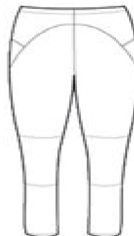
9. STEEPLCHASE LEGGINGS