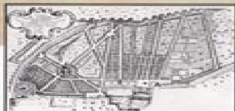
Regione, l'area di collina e l'area di valle, in verde, si inseriscono nel 'Piano Regolatore' del 1883, in rosso, e corrispondono alle 'zone' di costruzione del quartiere urbano, delineate dal 'comune' di via Torino (all'epoca con...