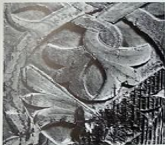
42. Charnières-sur-Loire doors, detail of carved and polychromed border, upper left valve