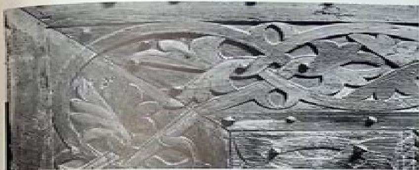
41. Charnières-sur-Loire doors, detail of carved and polychromed border, upper left valve