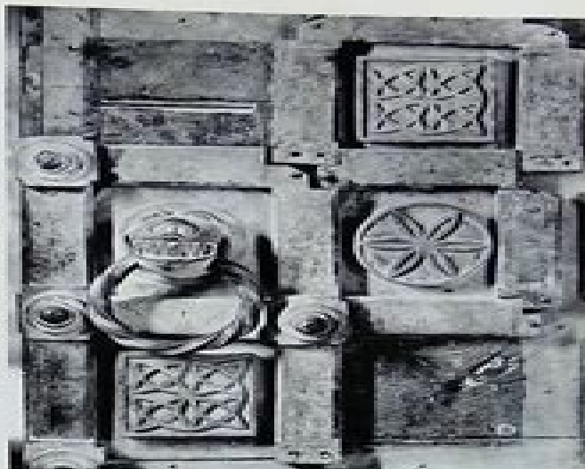
43. S. Clemente in Caserta, bronze doors, detail