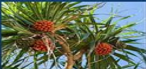
7. HALA ( PANDANUS TECTORIUS )