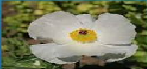
1. PUA KALA ( ARGEMONE GLAUCA )