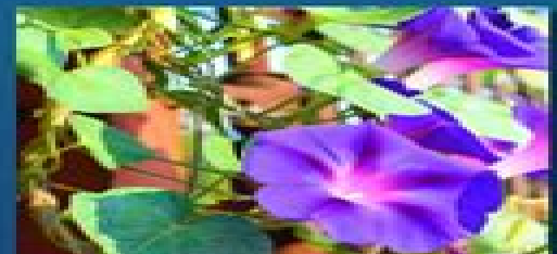
6. BLUE MORNING GLORY ( IPOMOEA INDICA )