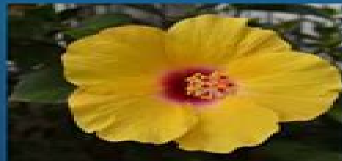
5. MA'O HAU HELE ( HIBISCUS BRACKENRIDGEI )