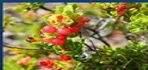
8. OHEO 'AI ( VACCINIUM RETICULATUM )