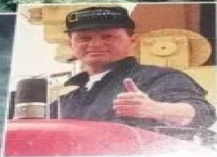
DR. ROBERT BALLARD