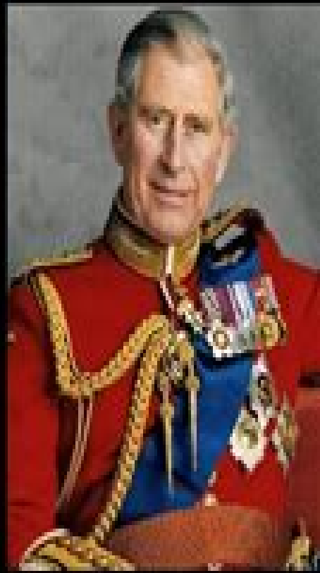
King Henry VIII Queen Victoria Queen Elizabeth King Charles III