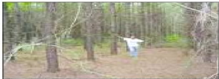
Increased growth of pine trees with fertilization (left), compared to trees without fertilization (right), is illustrated in these Alabama plots.