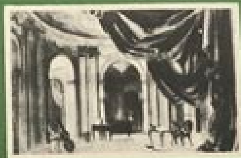
Scene from 'The High Toby'

QC3 HAMLET: Scenes from the film Full instructions for performance are given with the plays. Each 3/6