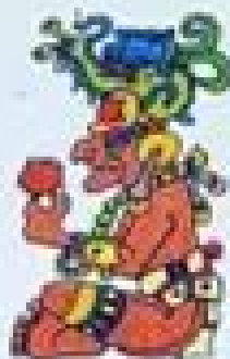
Itzamná Señora del cielo