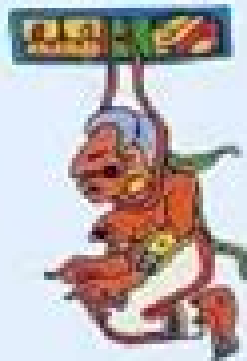
Tlaloc Dios del agua