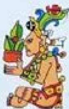
Yuc K'ul Dios del sol