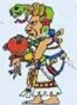
Quetzal Dios del viento, del agua y de la vida