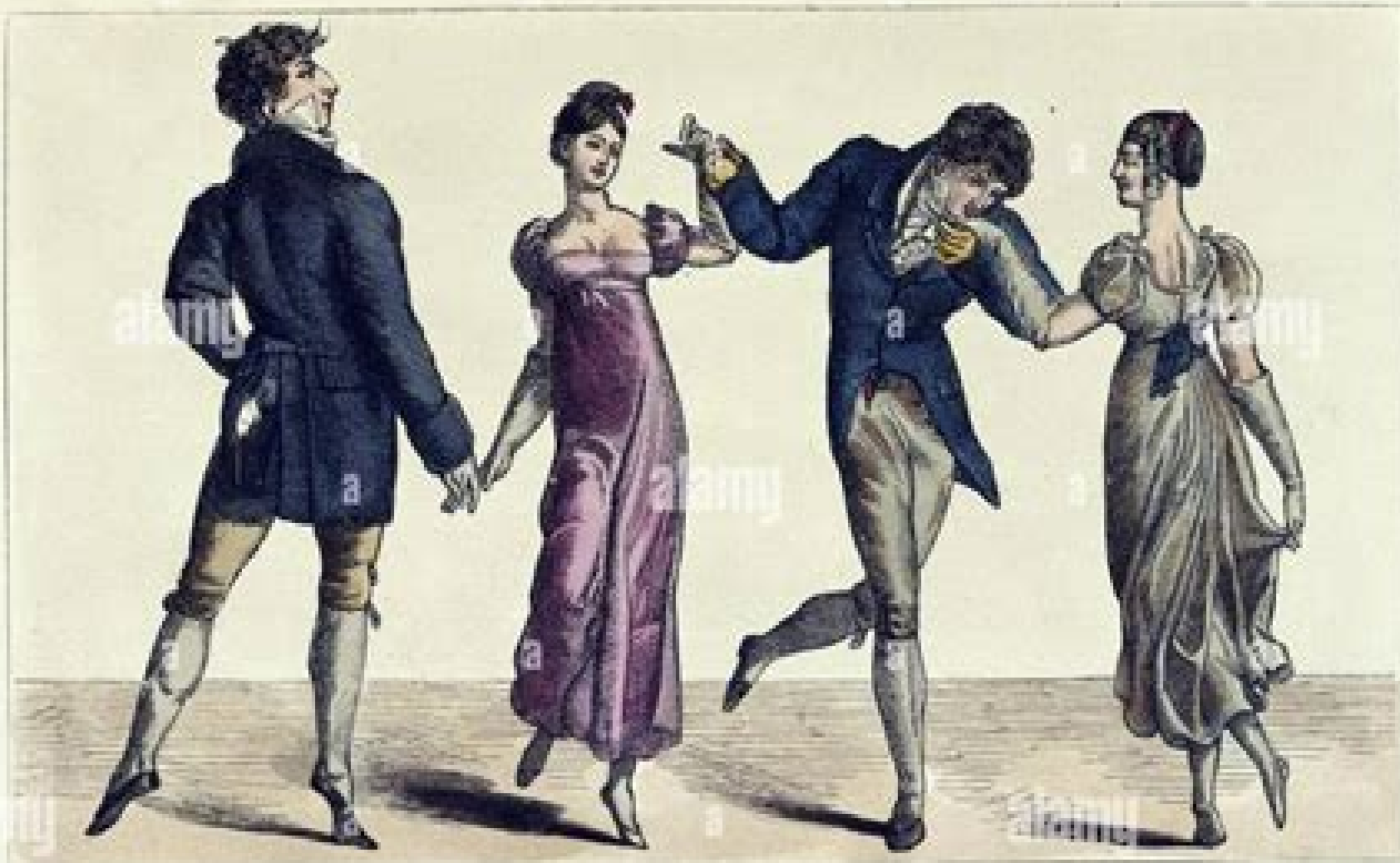
MARQUE OF WORCESTER.