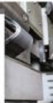
Figure 13: Bending sheet metal

When two walls are joined at a corner, the bend radius of the corner is critical. To reduce the risk of interference, the bend radius of the corner must be at least equal to the thickness of the material. However, because the bend radius is difficult to control, it's often recommended to use a larger bend radius than the minimum required.