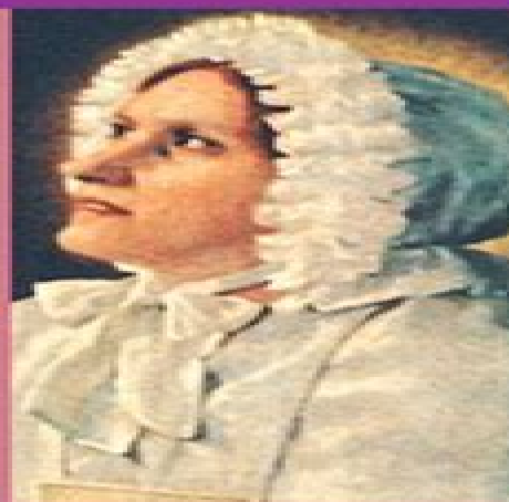
Bl. Anna Maria Taigi (1769-1837), wife, mother of seven, mystic and counselor of Popes and Saints.