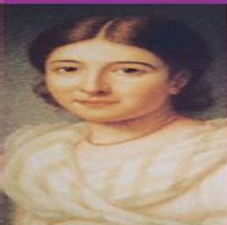
Ven. Pauline Jaricot (1799-1862), foundress of the Society for the Propagation of the Faith.

250 Canonized and Beatified Lay Men, Women and Children