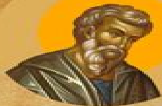
St Matthew the Evangelist