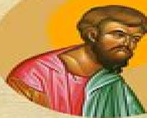
St James, son of Zebedee