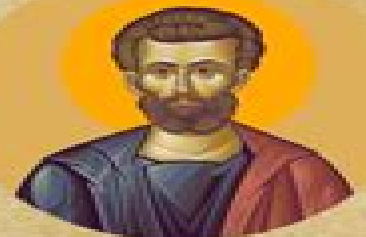
St James, son of Alphaeus