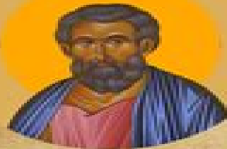
St Jude the Brother of the Lord