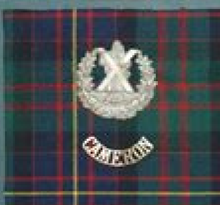
THE CAMERON HIGHLANDERS