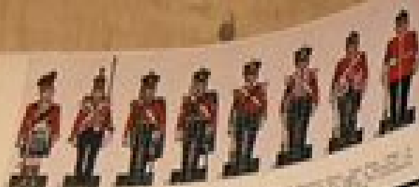
SEVEN REGIMENTS, 1660-1670. The first three are the Argyll, Perth and Seaforth Highland Regiments. The last four are the Argyll, Perth and Seaforth Highland Regiments.