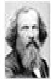
Dmitri Ivanovich Mendeleev