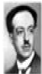
Louis de Broglie