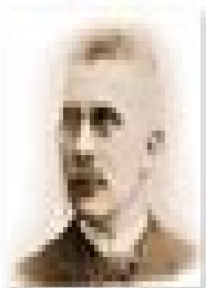
Henry Louis Le Châtelier