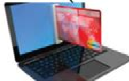
Computer Aided Design