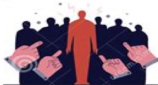
Critique Of Individualism