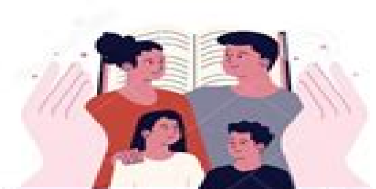
Appeal to Traditional Values and Religion