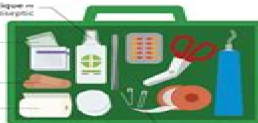
le ruban adhésif adhesive tape

A BILINGUAL VISUAL GUIDE TO OVER 10,000 FRENCH WORDS AND PHRASES