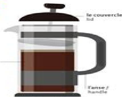
la cafetière à piston coffee press / cafetière