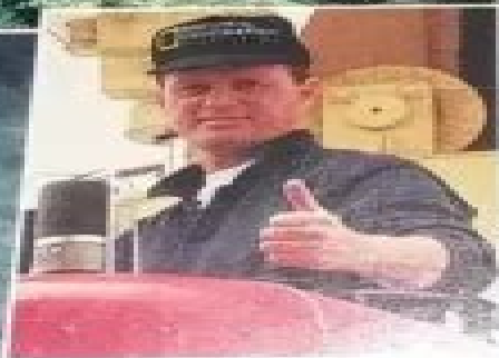
DR. ROBERT BALLARD