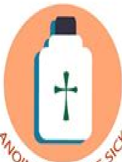
ANOINTING OF THE SICK