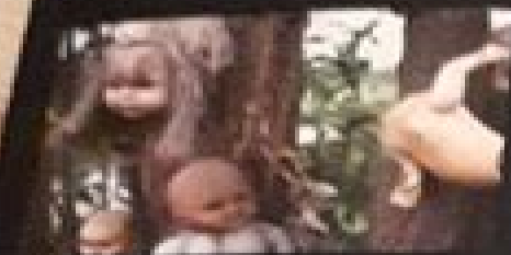
Haunted House, England: Haunted Places