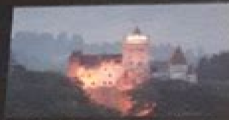
Dracula's Castle, Romania: Vampire Legends