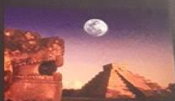
Chichén Itzá, Mexico: Myths & Legends