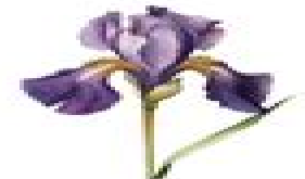
Iris ( Iris spp.)