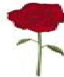
Rose ( Rosa spp.)