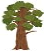
Giant Sequoia ( Sequoiadendron giganteum )