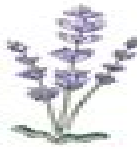
Lavender ( Lavandula spp.)