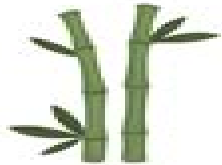
Bamboo ( Bambusoideae spp.)