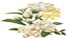
Jasmine ( Jasminum spp.)