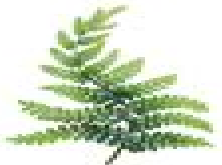
Fern ( Pteridophyta spp.)