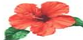
Hibiscus ( Hibiscus rosa-sinensis )