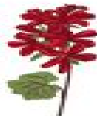
Geranium ( Pelargonium spp.)