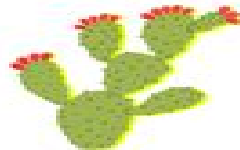
Cactus ( Cactaceae spp.)