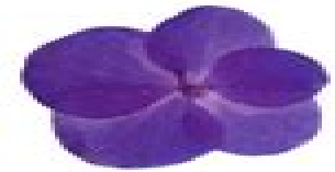
African Violet ( Saintpaulia ionantha )