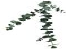
Eucalyptus ( Eucalyptus spp.)