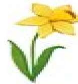
Daffodil ( Narcissus spp.)