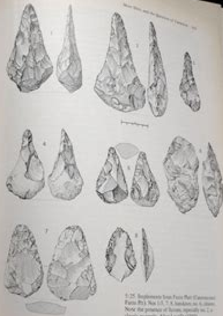
3:25 Supplemental Text: Four Well-Classified Forms (Pt 4) . Nos. 1-3, 7-8, handlist on 4, (text) No. 6: the prototype of lucens , especially no. 1, a classic example. After Lucida (1980).